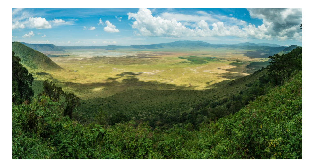
Partner with ARP Africa Travel for Expertly Crafted Ngorongoro Crater Tours

Whether you're introducing Ngorongoro Crater tours for the first time or expanding your current offerings, we're here to support you. <u>Get in touch with our team</u> to learn more about how we can help you create memorable Ngorongoro Crater experiences for your clients. Together, we can blend Tanzania's natural beauty, diverse wildlife, and cultural richness into an itinerary that leaves a lasting impact.